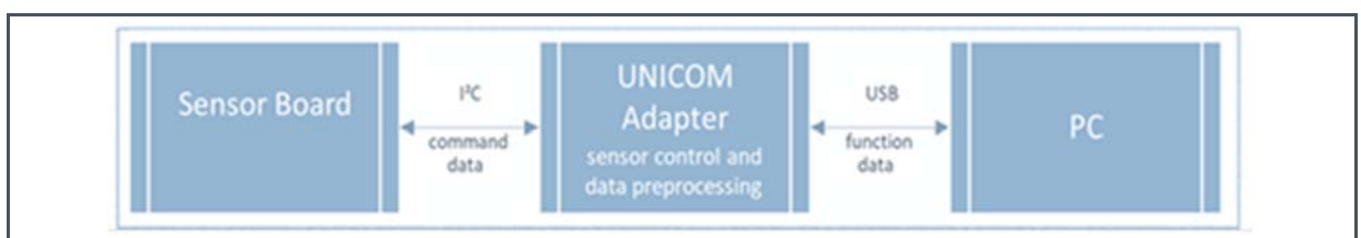
Figure 2: Hardware solution of the SDK with a Unicom interface to the PC

The Evaluation Kits for the AS7343 or AS7352 are described in their specified user manual. All the technical details for the sensor chips can be found in the datasheet. It is recommended to study both documents before using the SDK because in this description only specific details of the SDK are described. The SDK includes hardware and software parts. The hardware is identical to the used components in the EVKs and consists of a sensor board and I 2 C interface connected via USB to the PC.